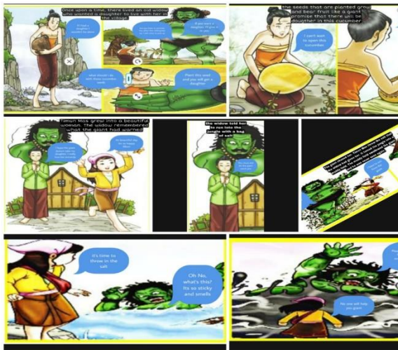
Figure 2. The Comic Strips of Timun Emas

From the comic strips above, there some questions given as below: