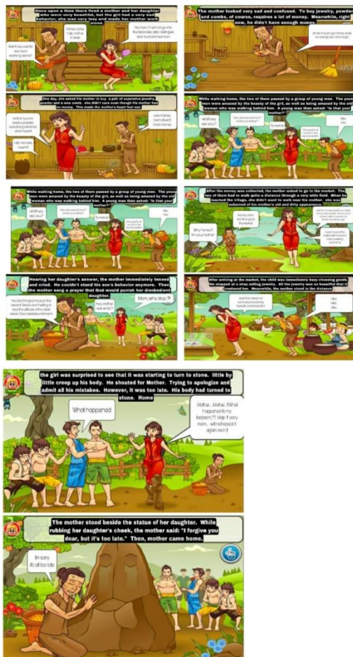
Figure 3. The Comic Strips of Batu Menangis

From the comic strips above, there some questions given as below: