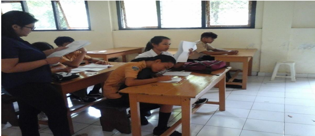
Picture 1: Students' Learning Activity in Doing the Task Guided by the Teacher